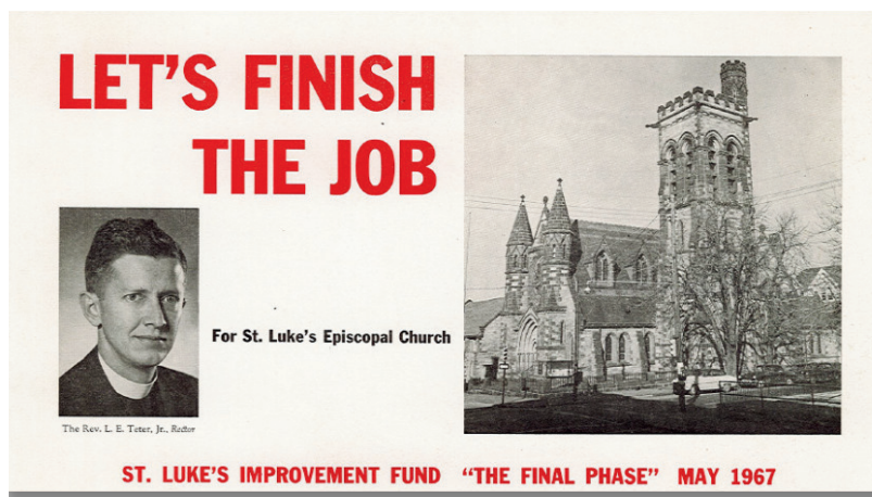
promotional materials from the 1967 improvement fund campaign

In 1970 the Improvement and Building Fund accrued a further $13,410 from pledges, but the church was not debt-free. Loans payable remained of $23,100 to banks and $6,325 to the diocese. Without fund-raising further efforts pledge money continued to trickle in: $7752-1971, $6879-1972, $5845-1973, $4011-1974. As of Dec. 31, 1974 (4½ years after the official end of the "Final Phase") outstanding loans still totaled $2700 to Lebanon banks and $3557 to the diocese. By the next annual report the Building and Improvement Fund had morphed into a Mortgage Interest Fund that included money received, borrowed, and paid in the sale of Trinity Chapel. The annual report for 1976 continued to list outstanding bank loans even as pledge money began to accumulate in the next capital campaign, the Centennial Challenge. ~